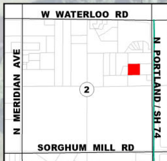
SECTION 2, T-14-N, R-4-W, 1.M LOCATION MAP