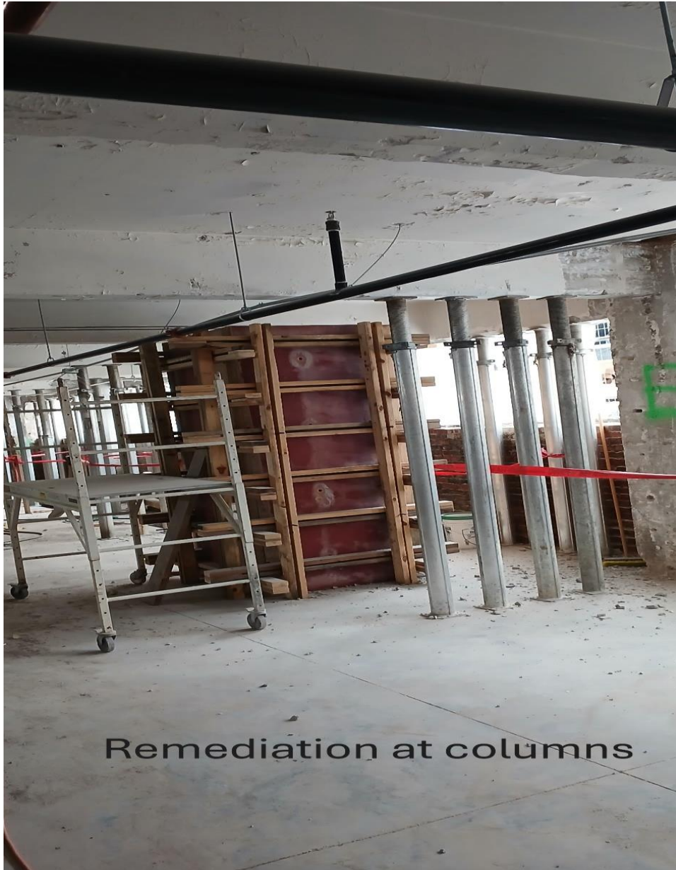
Remediation at columns