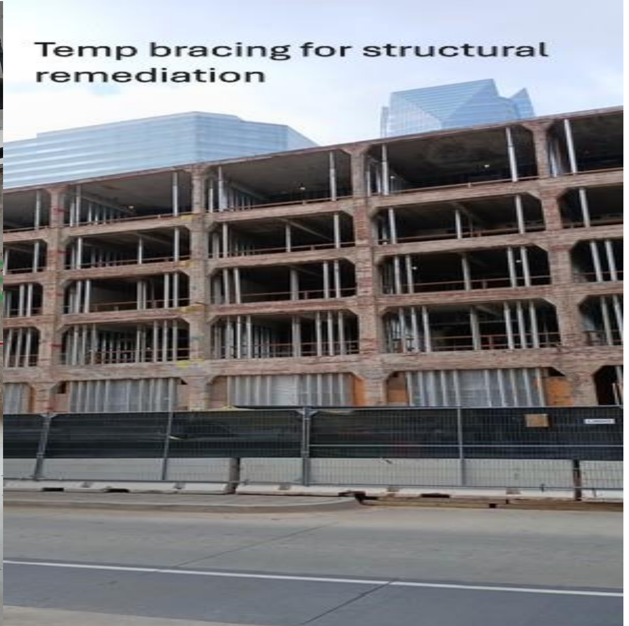
Temp bracing for structural remediation