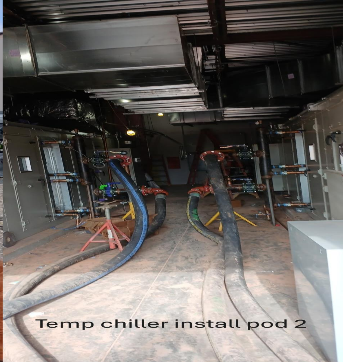
Temp chiller install pod 2