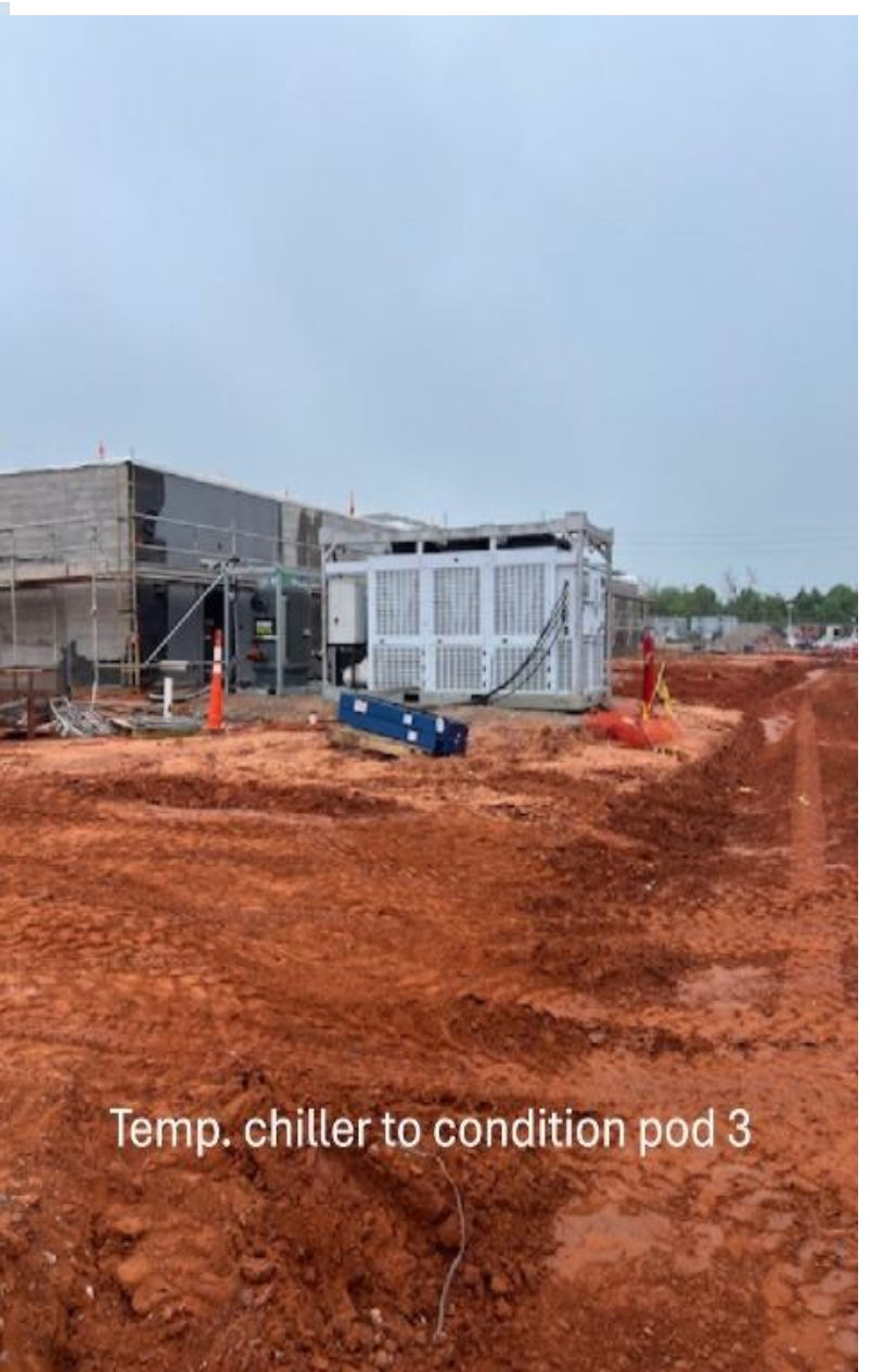
Temp. chiller to condition pod 3