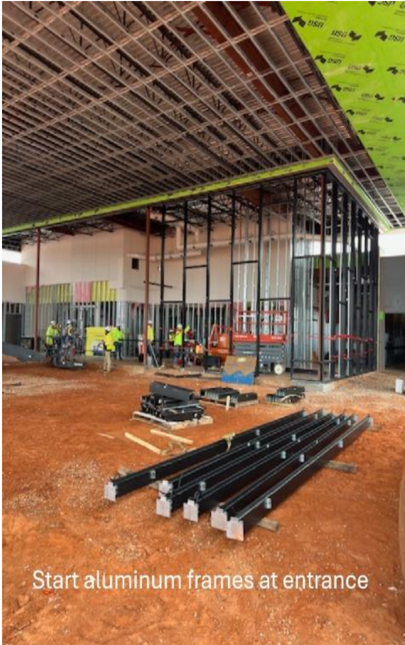
Start aluminum frames at entrance