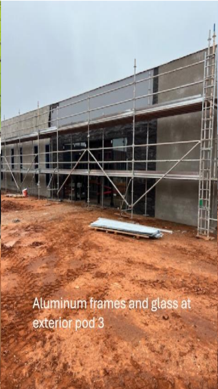
Aluminum frames and glass at exterior pod 3