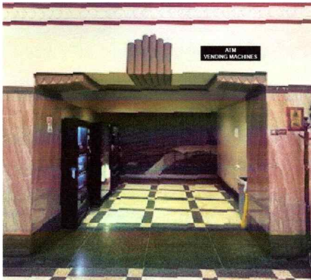
Option 1: Flat sign

Oklahoma's Credit Union will provide one (1) sign for the ATM that includes directions to the vending machine. Oklahoma County Courthouse can choose either a flat sign or corridor sign. Mock ups are provided below.