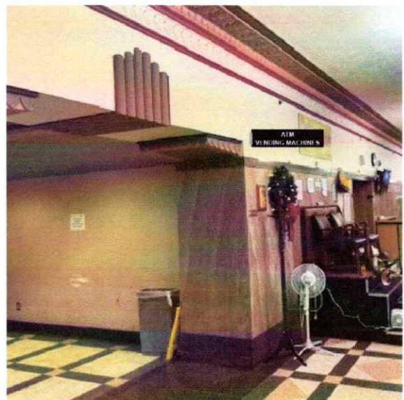
Option 2: Corridor Sign

Oklahoma County Courthouse will also choose whether its facilities team or Oklahoma's Credit Union's facilities team installs the sign.