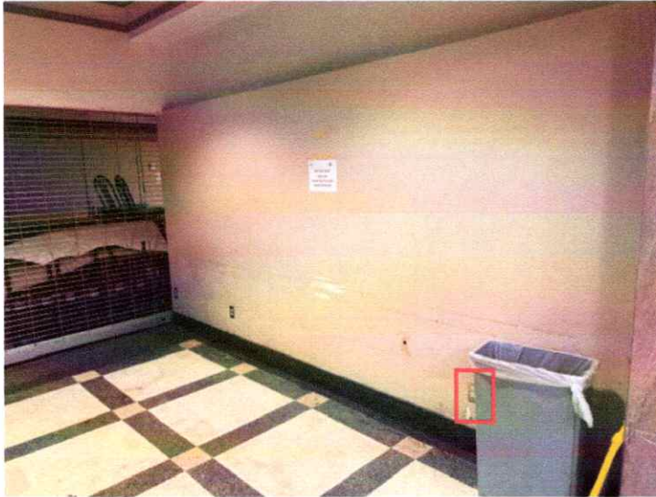
Location of power outlet for ATM (indicated by the red box)

The ATM will use the pre-existing power outlet pictured below.