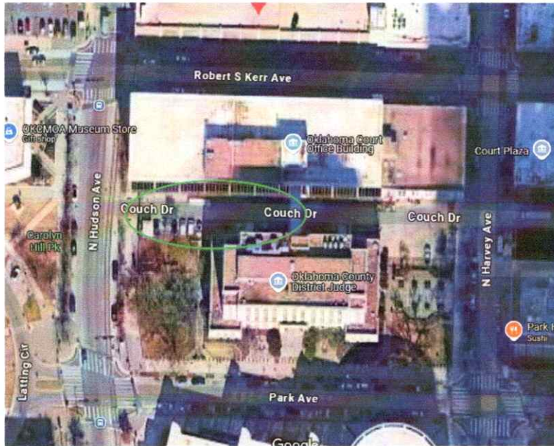
Location of parking and entry access