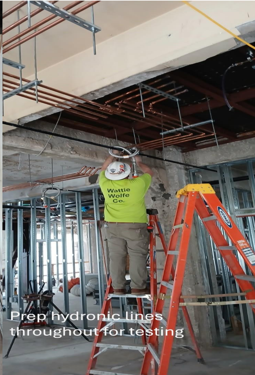
Prep hydronic lines throughout for testing