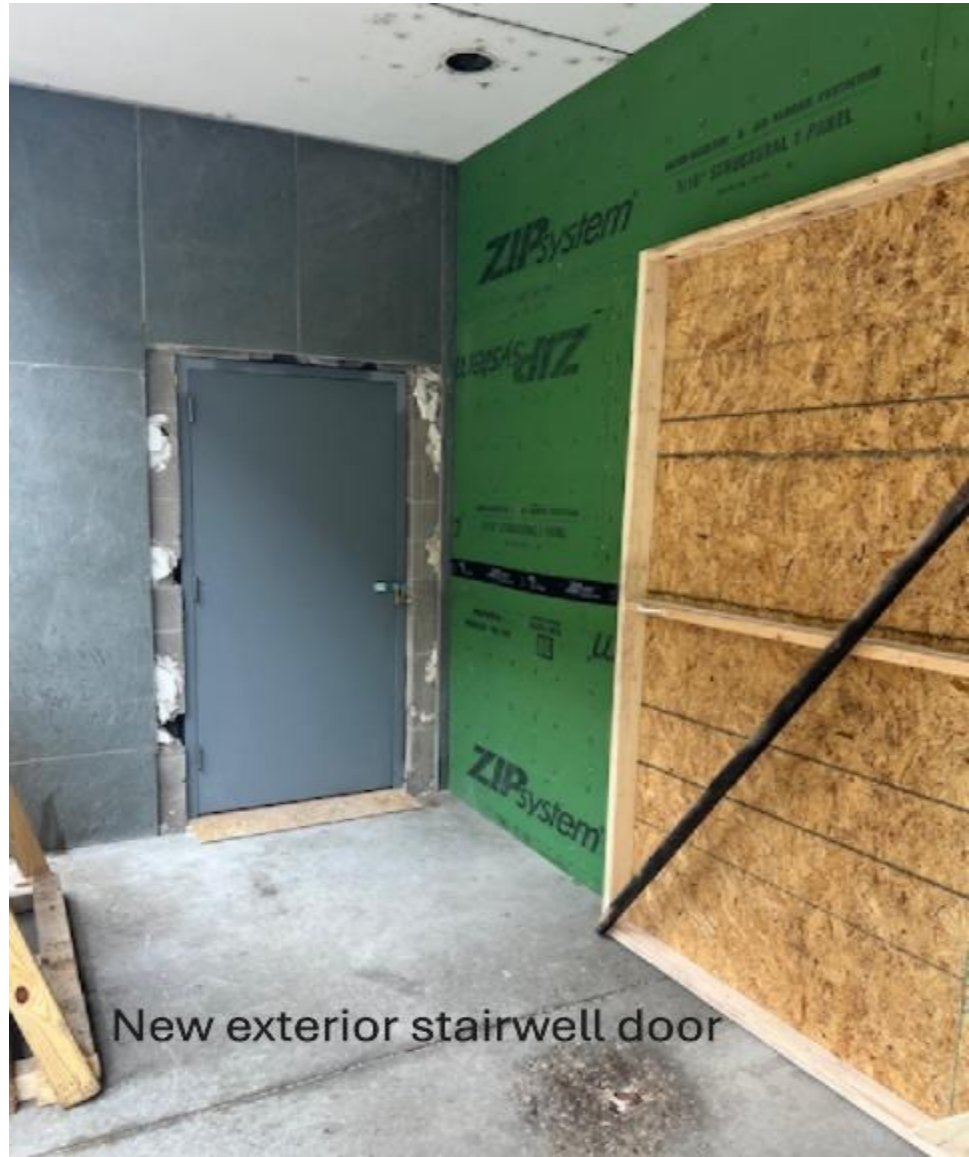
New exterior stairwell door