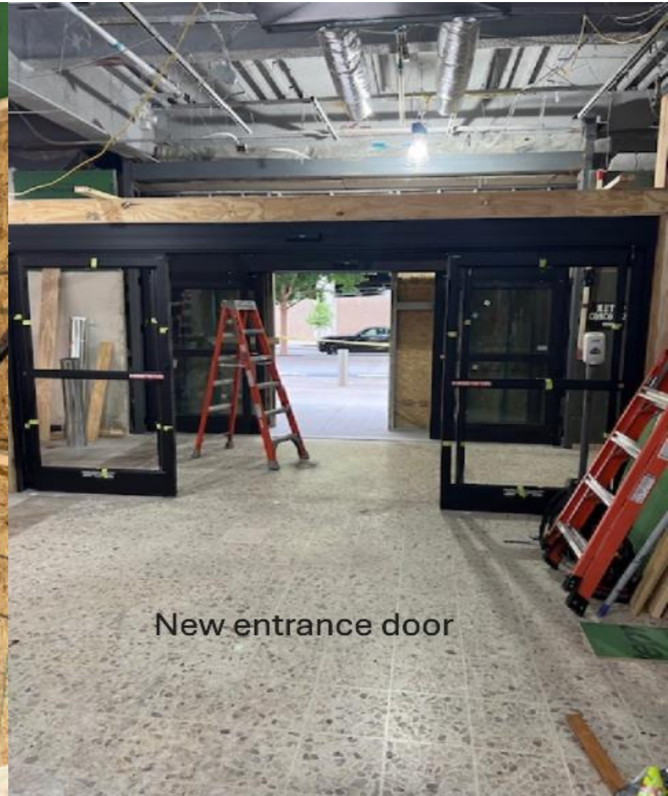
New entrance door