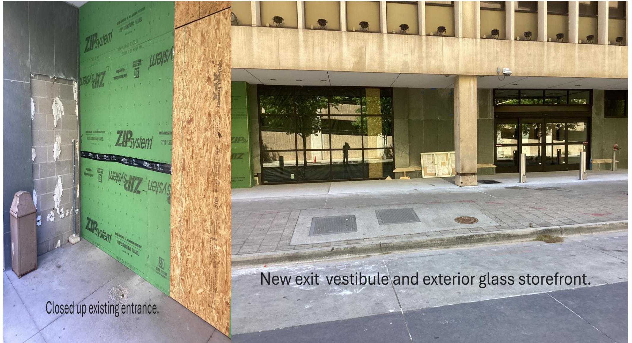
Closed up existing entrance.